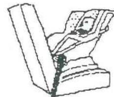
Rear Facing Convertible Seat