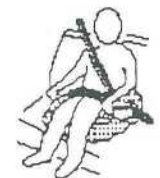
Booster Seat with Lap Shoulder Belt

Unfortunately, child safety seats are among the most commonly recalled consumer products. Last year alone Consumer Reports alerted its readers to safety problems affecting some 8.5 million seats.