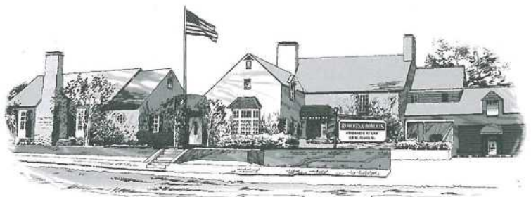
Located across from Bergfeld Park on Broadway