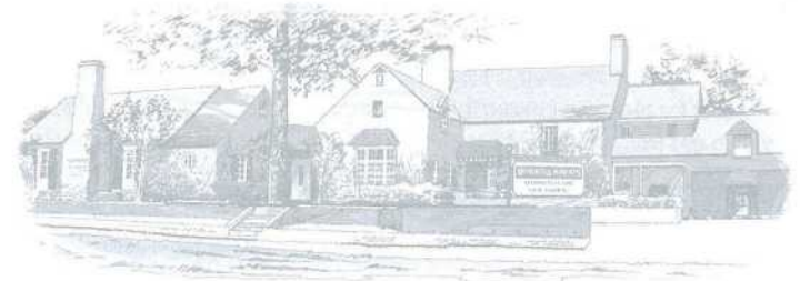
Located across from Bergfeld Park on Broadway